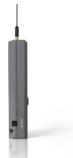
Charge Socket for internal Lithium battery