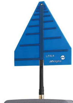
Directional High Frequency Antenna