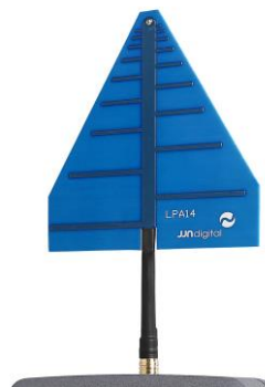
Directional High Frequency Antenna