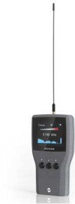
PRO-W10GX using Whip Antenna