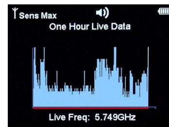
One Hour Live Graph Screen