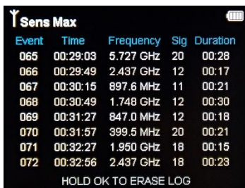
Detected Event Log List Screen