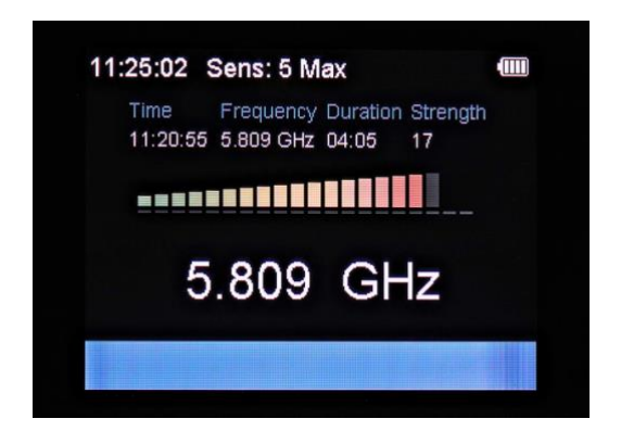
Live Main Screen detecting signal