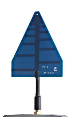
Directional High Frequency Antenna