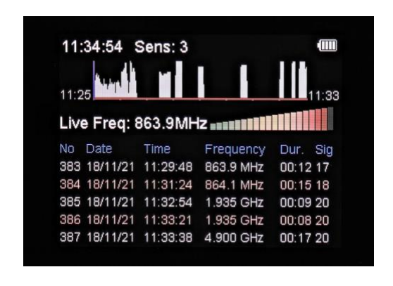
Graph Log Screen detecting pulsed signal