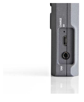
Charge Socket & Earphone Socket