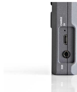
Charge Socket & Earphone Socket