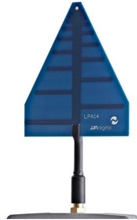
Directional High Frequency Antenna