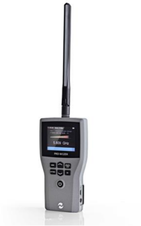
PRO-W12DX using hinged Omnidirectional Antenna