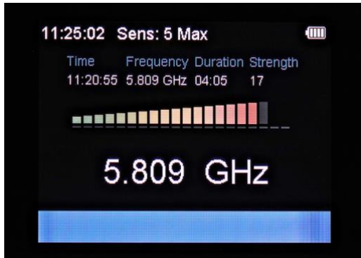
Live Main Screen detecting signal