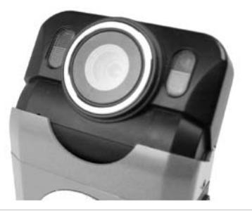
lens move upward(30°)