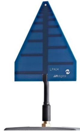
Directional High Frequency Antenna