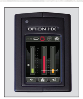
Tx and Rx graph displays power, 2nd and 3rd harmonic levels and touch screen trip and power level adjustments.