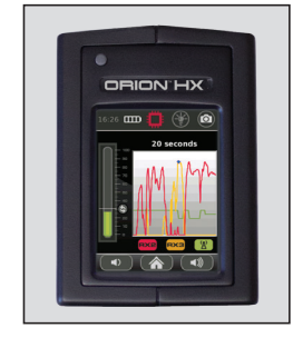
The histogram graph displays continuous history of harmonic response and power adjustment from 10 - 60 second duration.

U.S. PATENTS: 6,057,765; 6,163,259, 7,212,008, 7,630,853, 9,209,856. U.K. PATENTS: GB2344423; GB2351154; GB2381077; GB2381078